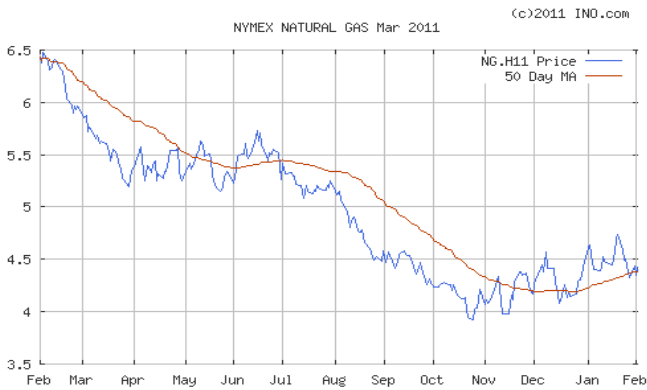
Above Graph – March 2011 NYMEX gas futures