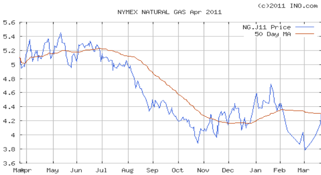
Above Graph – April 2011 NYMEX gas futures