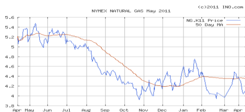
Above Graph – May 2011 NYMEX gas futures

The Crude oil price for May is lower this week at $106.75 per barrel. Heating oil is lower at $3.18 per gal. Unleaded gasoline futures are higher this week at $3.25 and gasoline at the pump is around $3.89...in Indiana. The natural gas storage report today was an injection of 28 BCF. Storage is 137 BCF lower than last year but 10 BCF higher than the 5 year average.