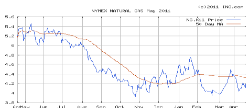
Above Graph – May 2011 NYMEX gas futures

The Crude oil price for May is higher this week at $111.15 per barrel. Heating oil is higher at $3.19 per gal. Unleaded gasoline futures are higher this week at $3.27 and gasoline at the pump is around $4.09...in Indiana. The natural gas storage report today was an injection of 47 BCF. Storage is 165 BCF lower than last year but 23 BCF higher than the 5 year average.