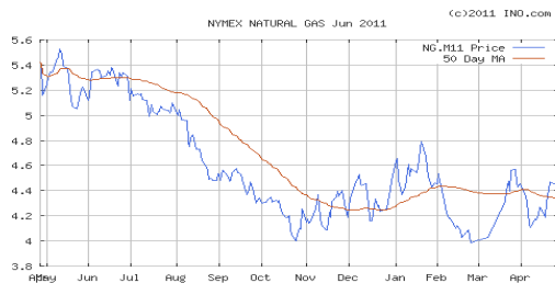
Above Graph – June 2011 NYMEX gas futures

The Crude oil price for June is higher this week at $112.92 per barrel. Heating oil is higher at $3.24 per gal. Unleaded gasoline futures are higher this week at $3.45 and gasoline at the pump is around $4.15...in Indiana. The natural gas storage report today was an injection of 31 BCF. Storage is 215 BCF lower than last year and 11 BCF lower than the 5 year average.